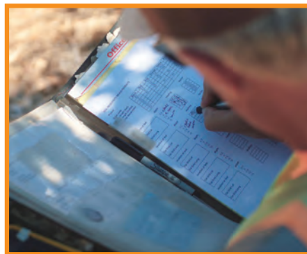
Pipeline Condition Assessment