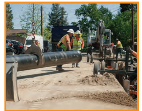
Water Main Replacement