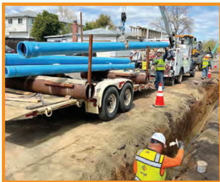
Patton Ave Water Main Project