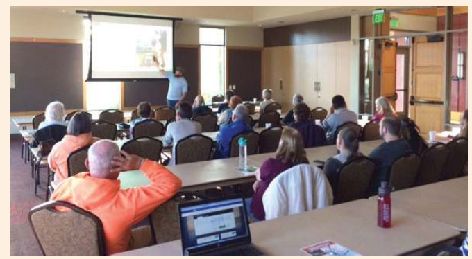
Participants enjoying the presentation at our April WaterSmart class.

Classes are held at Citrus Heights Community Center, Room: South A, 6300 Fountain Square Drive, Citrus Heights, CA 95621. Free parking available.