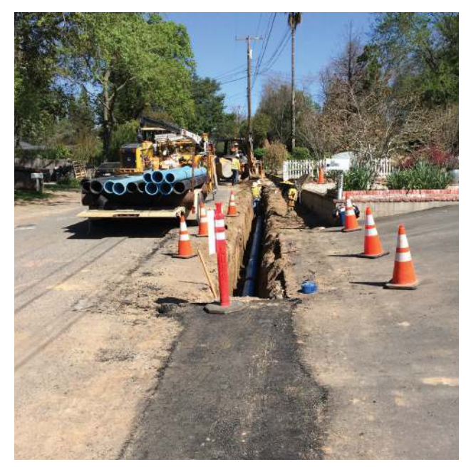
Rosa Vista Main Replacement Project.

Stock Ranch Residential Service Replacements Design Summer 2018