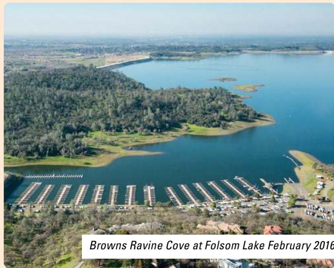
Browns Ravine Cove at Folsom Lake February 2016

State hasn’t been as fortunate and drought continues in other parts of California. The CHWD Board of Directors took that into consideration when it adopted a Stage 2 Water Alert with a voluntary target 5-10% reduction in water use from 2013 levels.