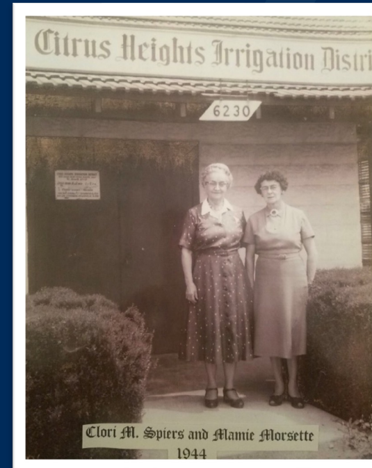
District staff in front of original Administration Building- 1944