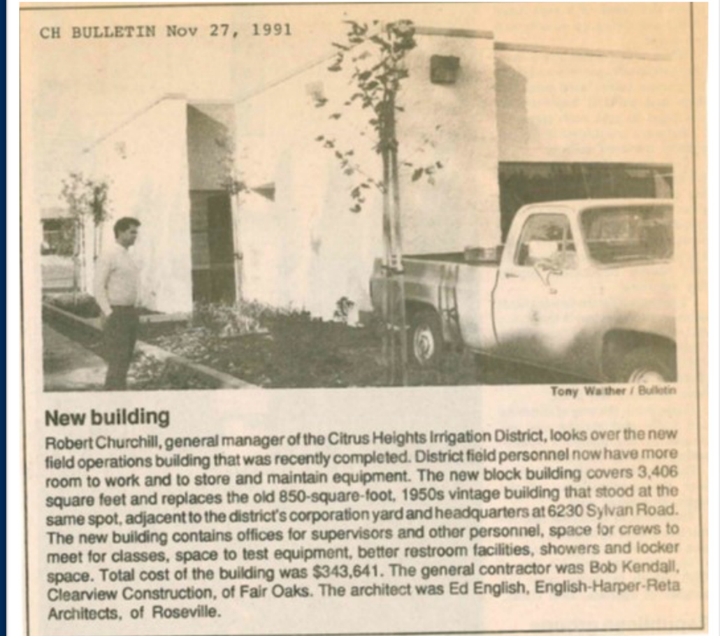
District Operations Building Completion Bulletin with Bob Churchill - 1991