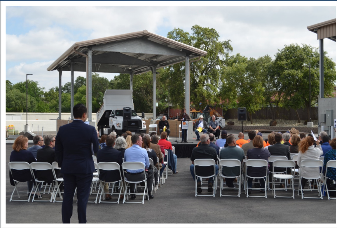
Corporation Yard Safety Improvement Project Ribbon Cutting - 2018