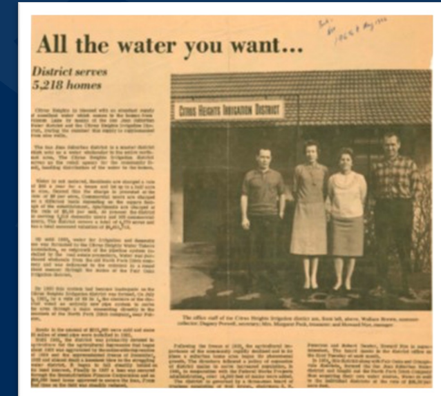
District staff in front of original Administration Building - 1965