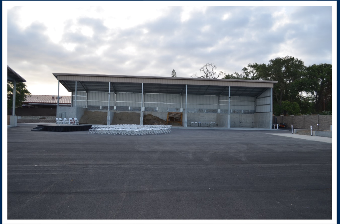
Corporation Yard Safety Improvement Project Ribbon Cutting - 2018