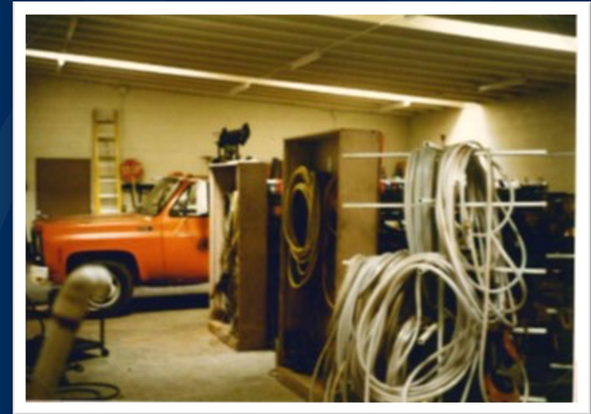
District Shop Building - 1987