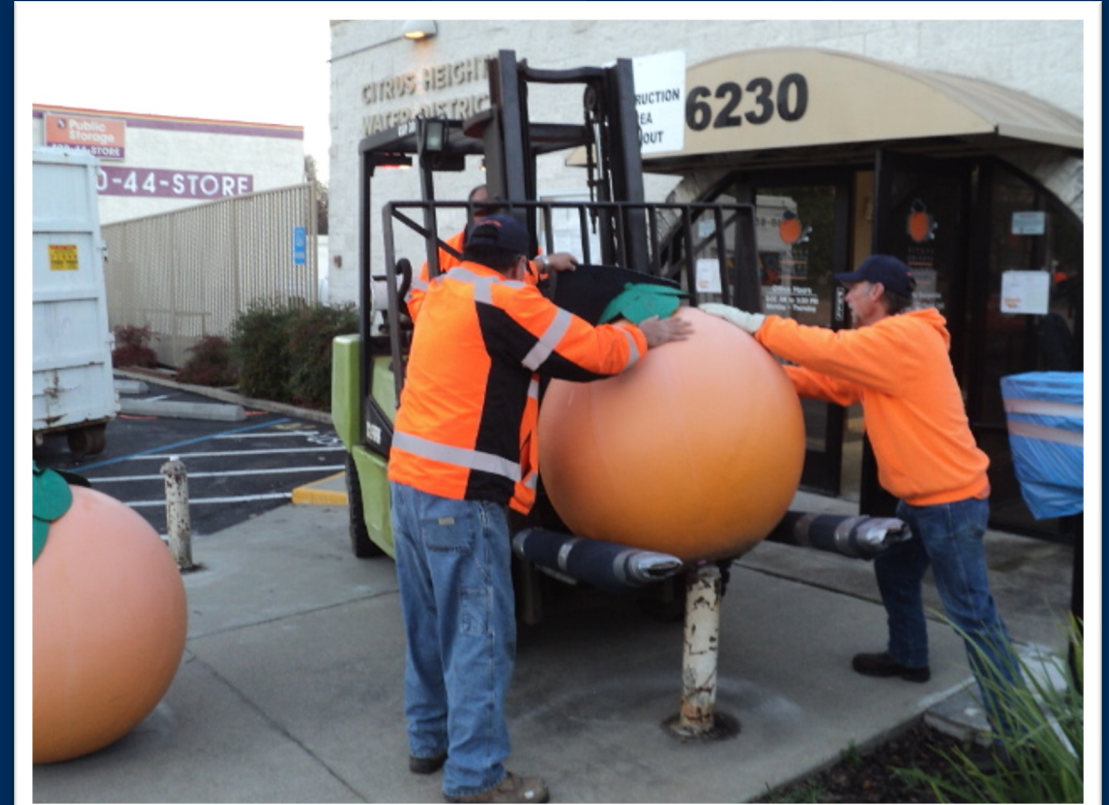
Administration Building Remodel - 2015