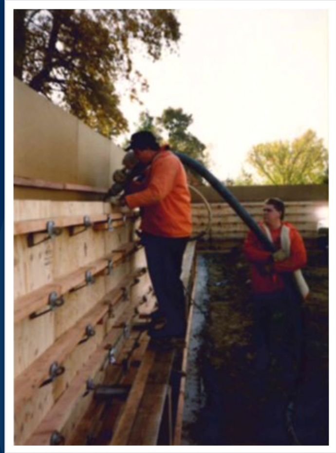
Material Storage Wall Construction - 1992