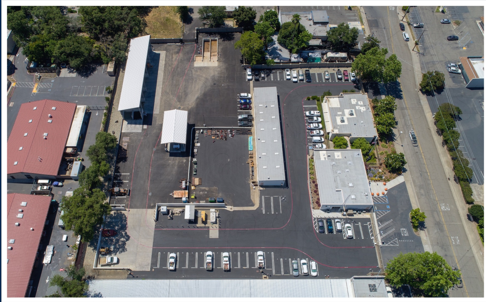
Aerial View of Corporation Yard - 2018