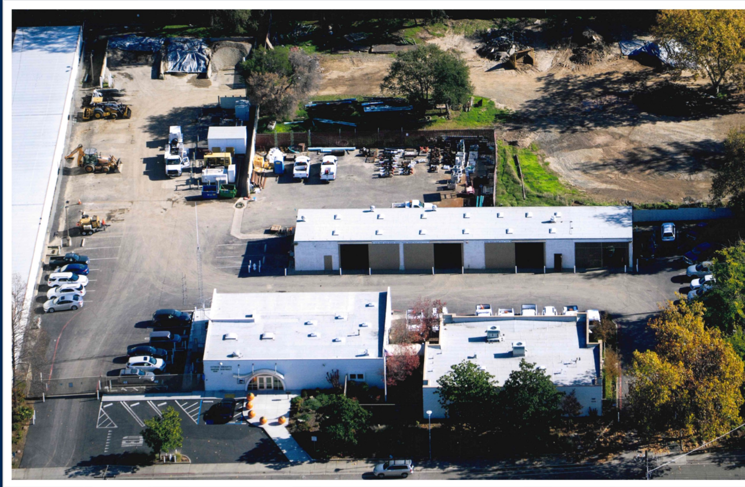
Aerial View of Corporation Yard – 2006