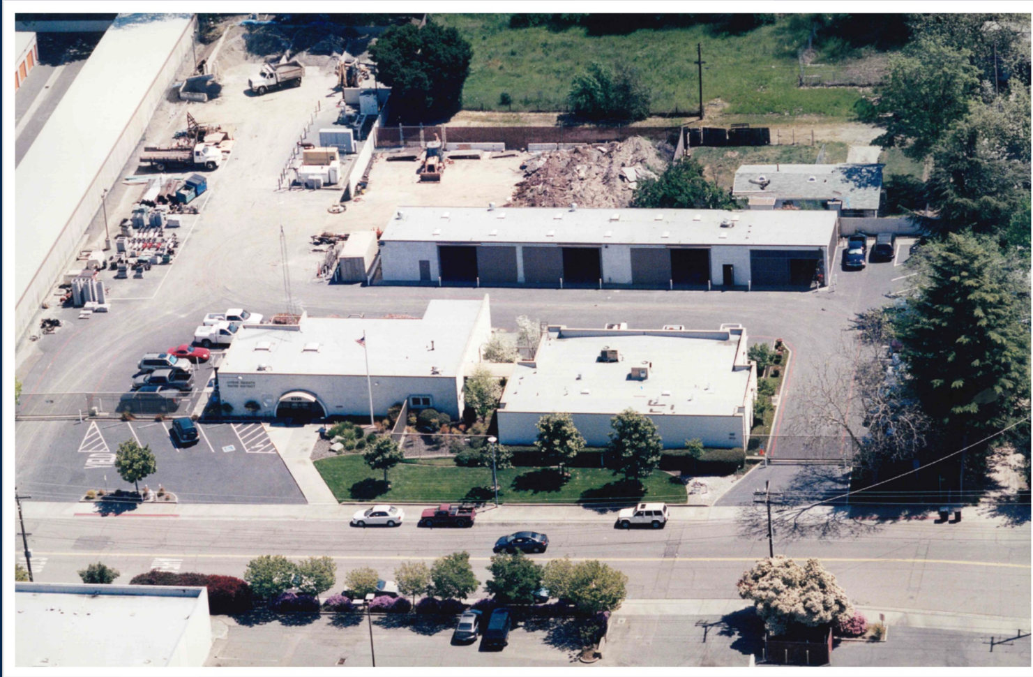
Aerial View of Corporation Yard - 1999