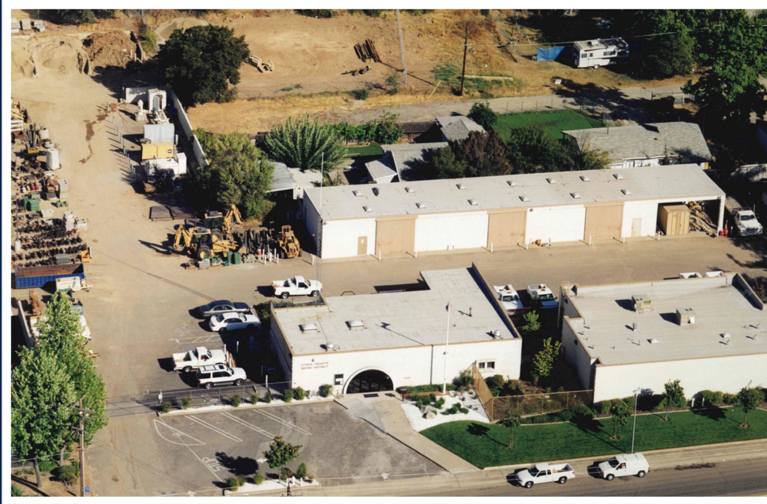
Aerial View of Corporation Yard – Early 1990's