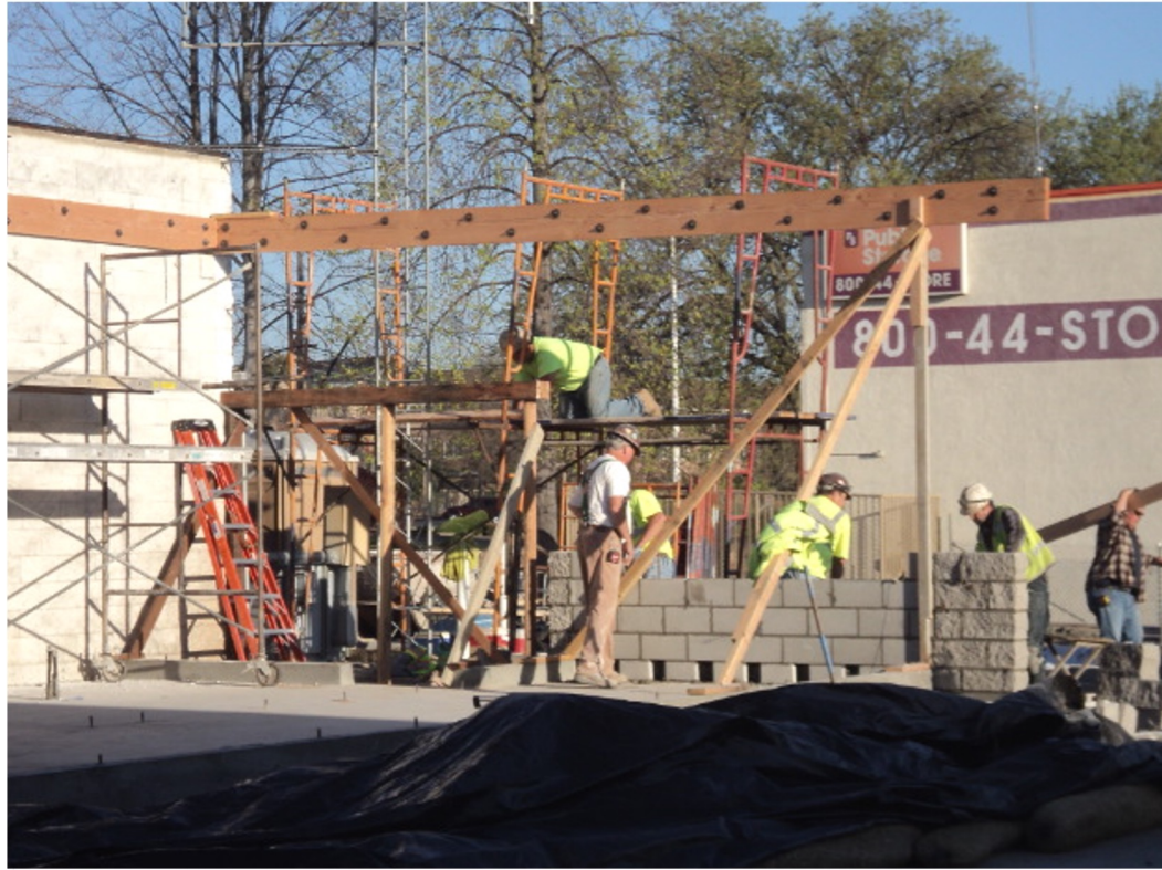
Administration Building Remodel - 2015