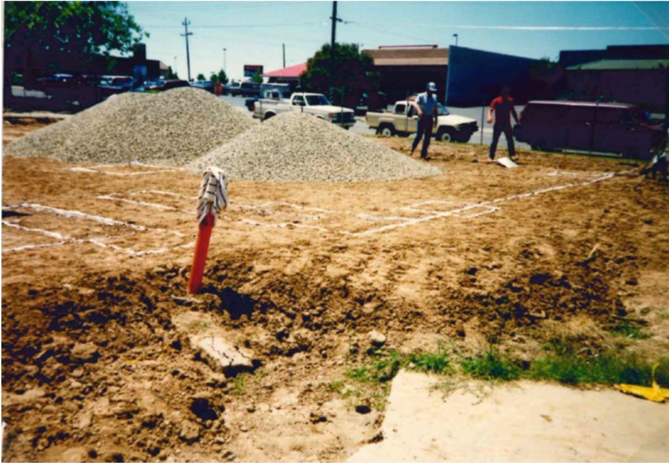
District Operations Building Planning - 1991