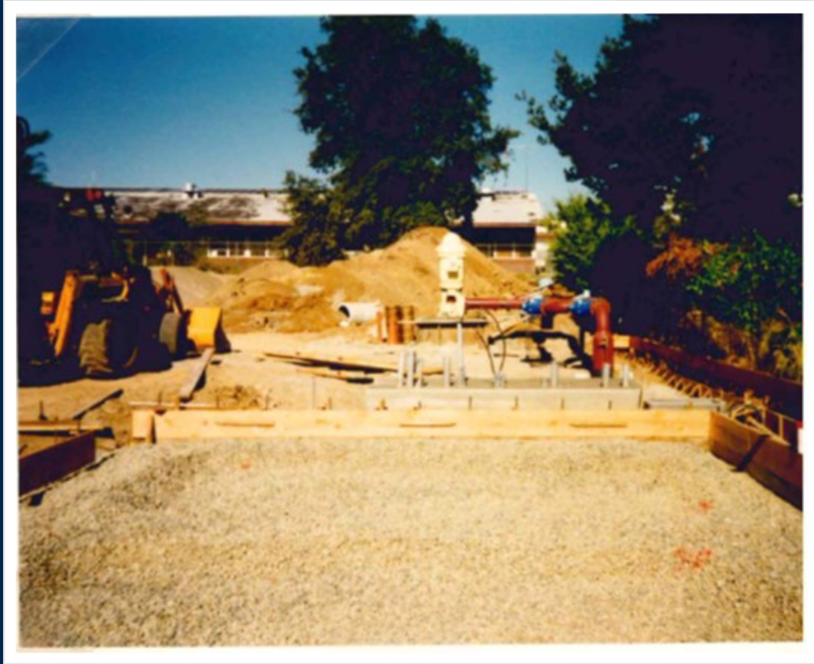
Sylvan Well Construction - 1991