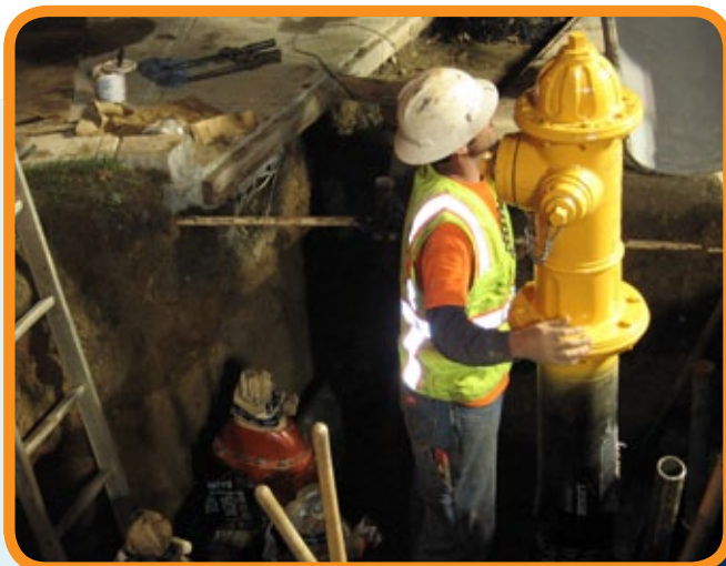
A crew member works in a trench to replace a CHWD fire hydrant. CHWD’s 271 miles of underground pipes not only provide water to homes and businesses, but also serve municipal needs such as fire hydrants.